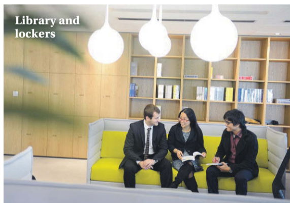
Library and lockers