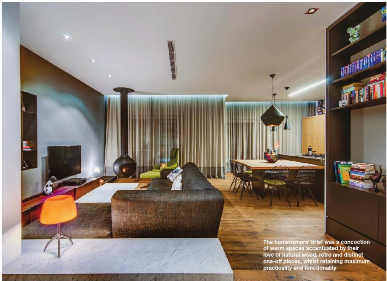
The homeowners' brief was a concoction of warm spaces accentuated by their love of natural wood, retro and distinct one-off pieces, whilst retaining maximum practicality and functionality