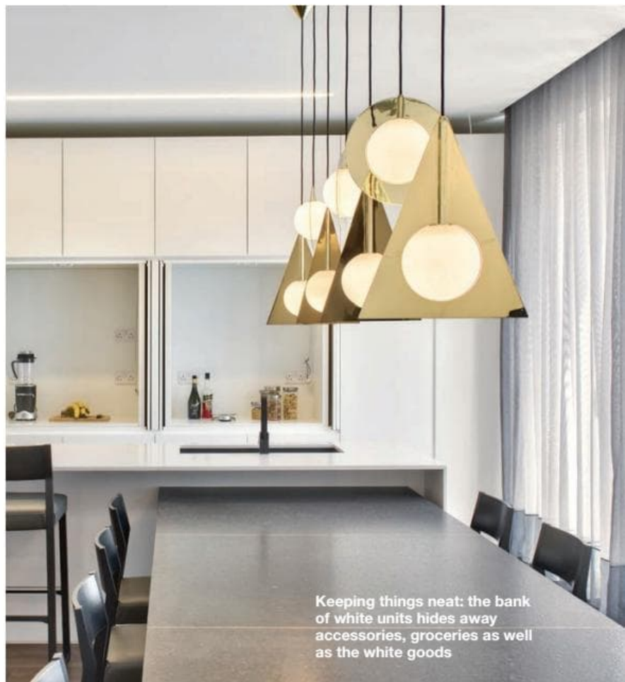
Keeping things neat: the bank of white units hides away accessories, groceries as well as the white goods