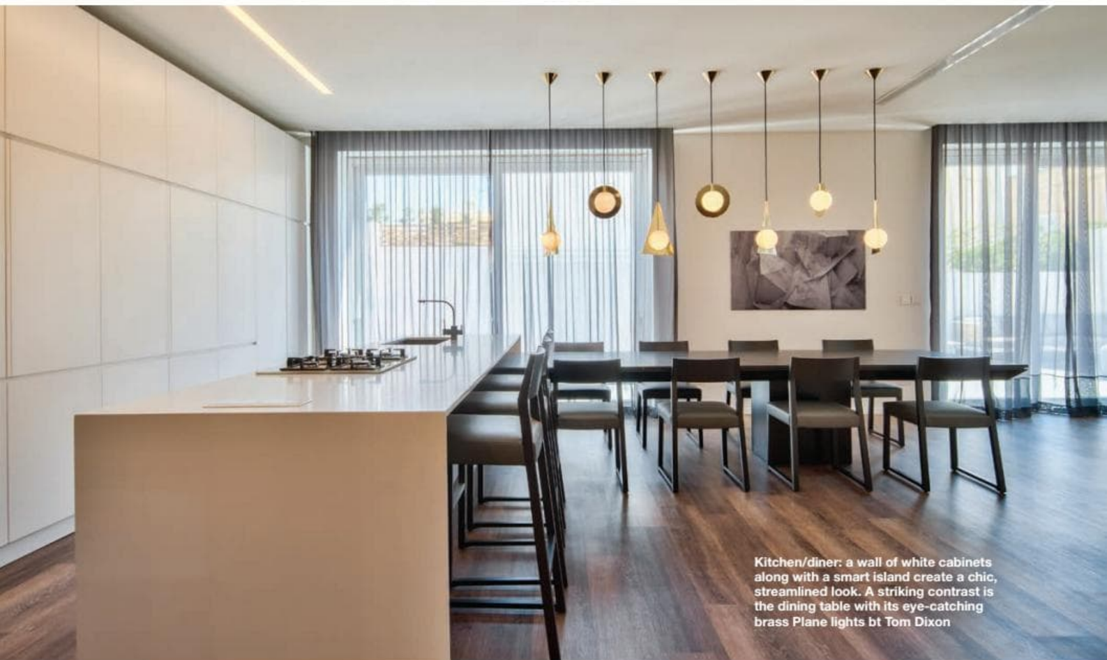
Kitchen/diner: a wall of white cabinets along with a smart island create a chic, streamlined look. A striking contrast is the dining table with its eye-catching brass Plane lights by Tom Dixon