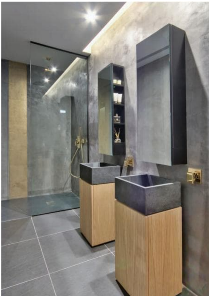
Bedroom (above): a monochrome palette combined with texture create a cosy bedroom. The ensuite bathroom (below left) has smart slate basins while the family bathroom (below right) is in travertine.