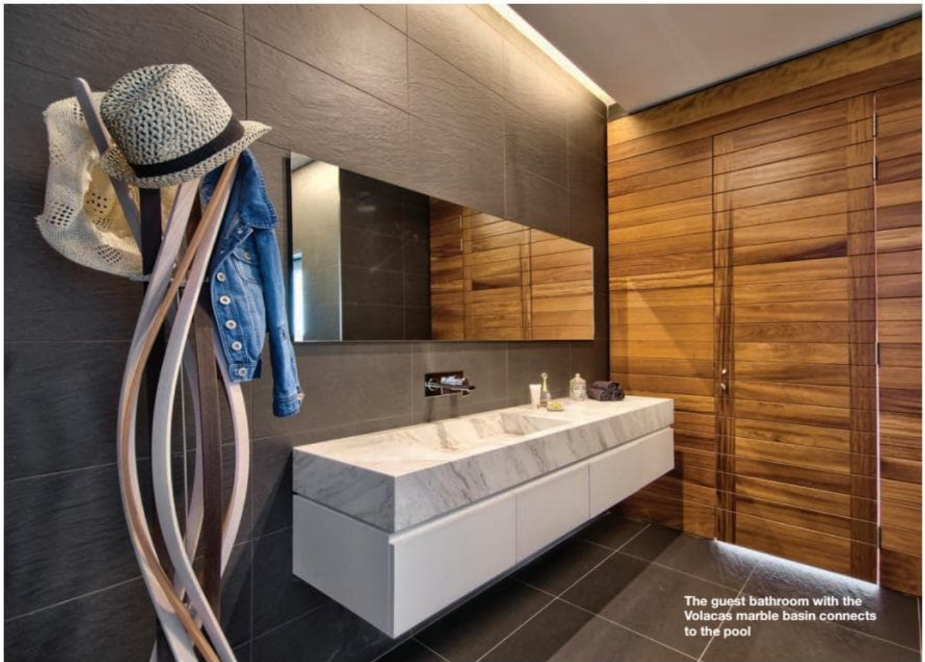
The guest bathroom with the Volacas marble basin connects to the pool