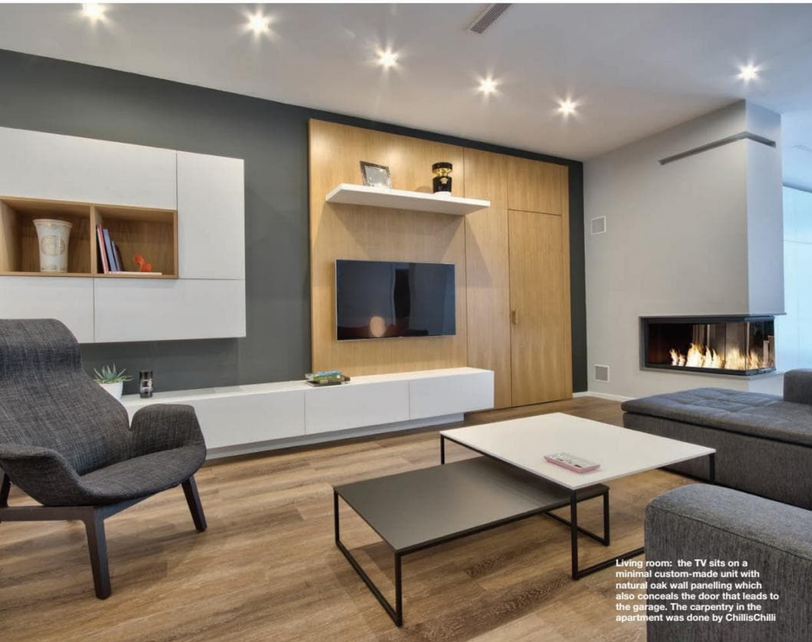
Living room: the TV sits on a minimal custom-made unit with natural oak wall panelling which also conceals the door that leads to the garage. The carpentry in the apartment was done by ChillisChilli

H aving lived in spacious homes as children, but started out their married life in a small semi-basement maisonette, the young couple who bought this property were sure about what they wanted from their new home. 'We both agreed that we are the kind of people that need space and natural light. We both work hard and coming home to a small and cluttered place was not good for us.'