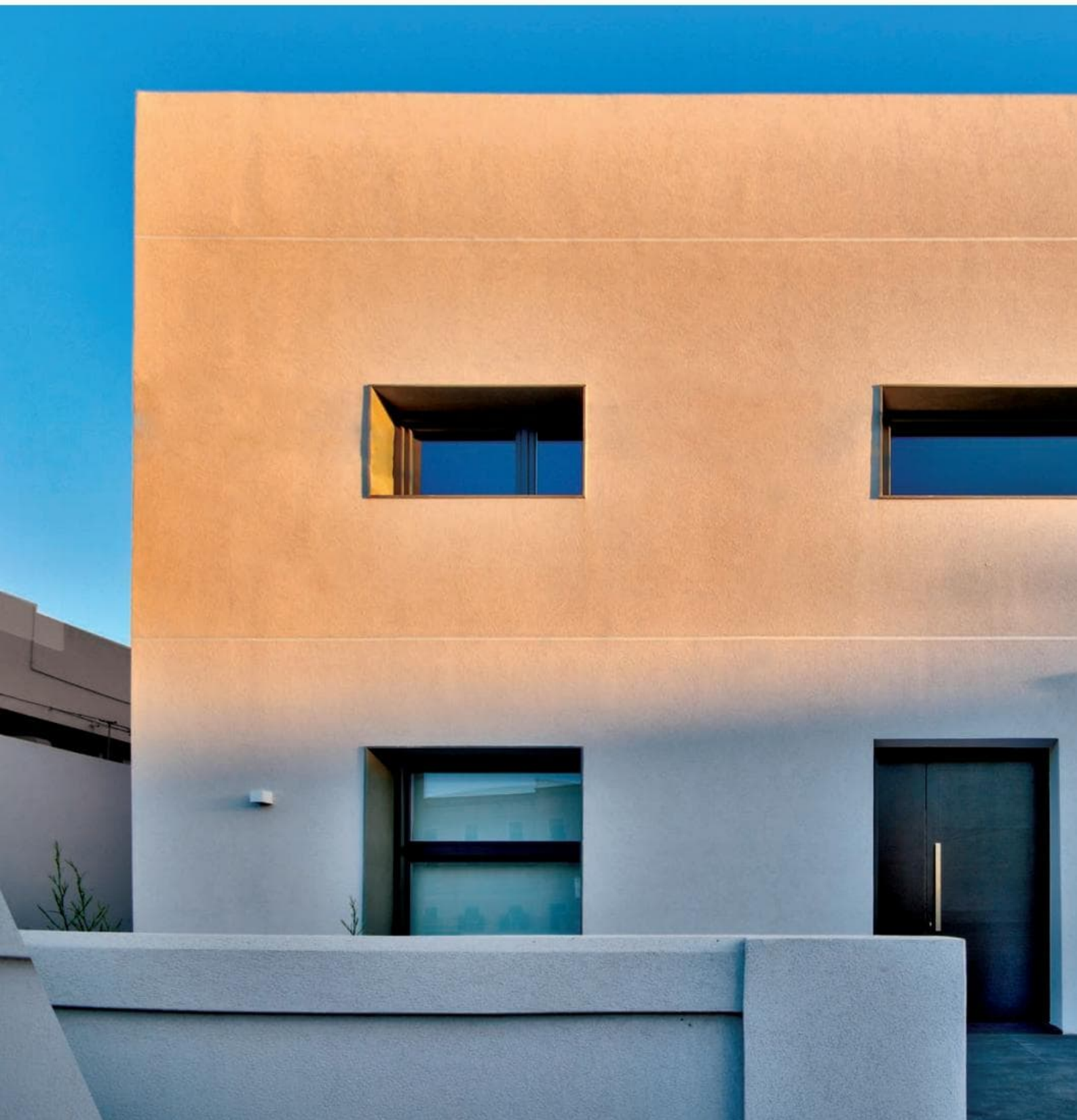
Exterior: the shell of the building was kept but given a modern makeover